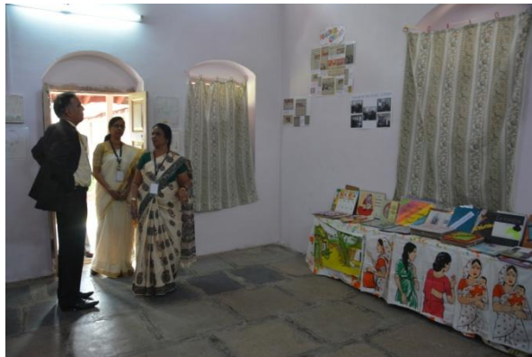
Home Science department visit