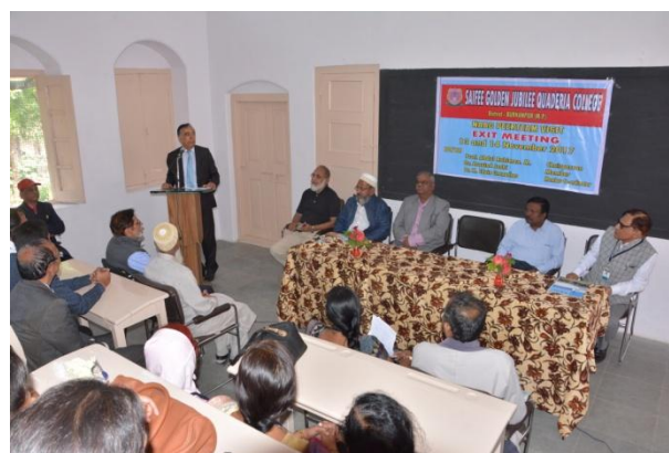
Evaluative address by chairman