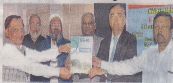
कादरिया कॉलेज प्राचार्य को नैक ने प्रमाण पत्र दिया।