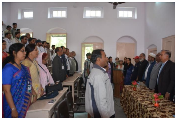
National anthem at exit meeting