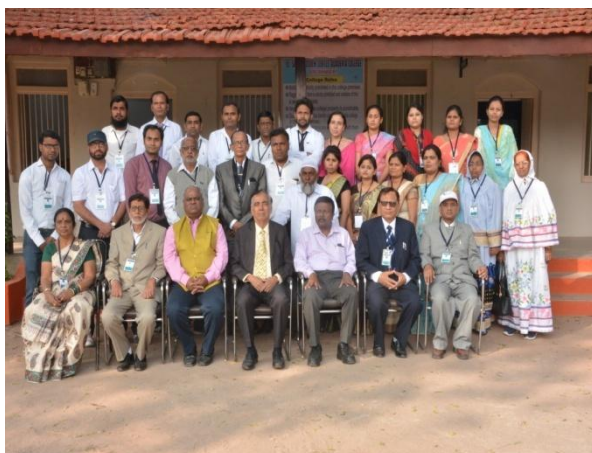
PTM with Teaching staff