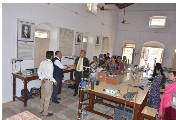
PTM in Physics department