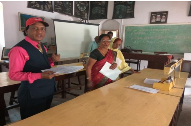
Judges at drawing competition