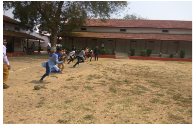
Girls' 100 mtr. race