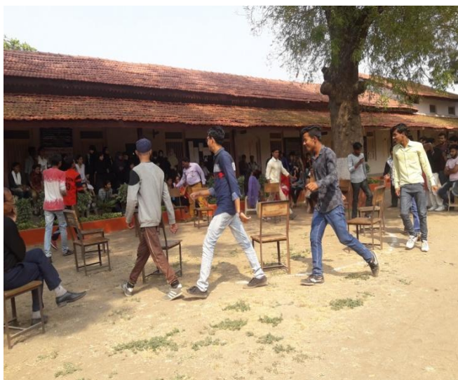
Boys' musical chair race