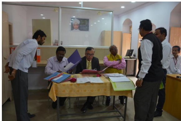
PTM visit to Office