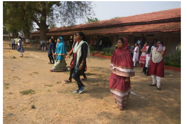
Girls' lemon & spoon race