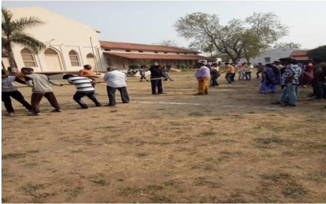
Tug of war