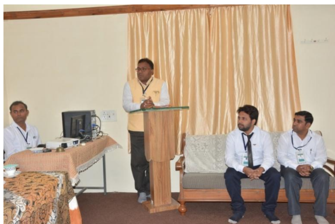
Interaction with Commerce staff