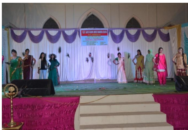
A view of the cultural show