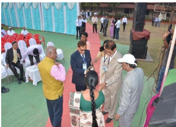
Lighting the lamp by PTM