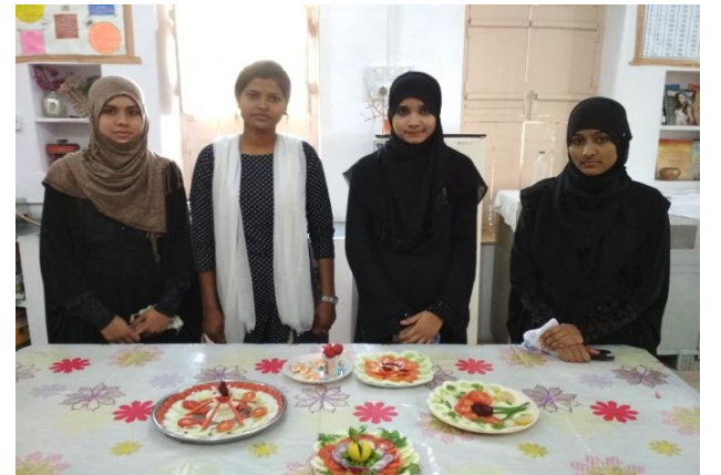
Salad decoration competition