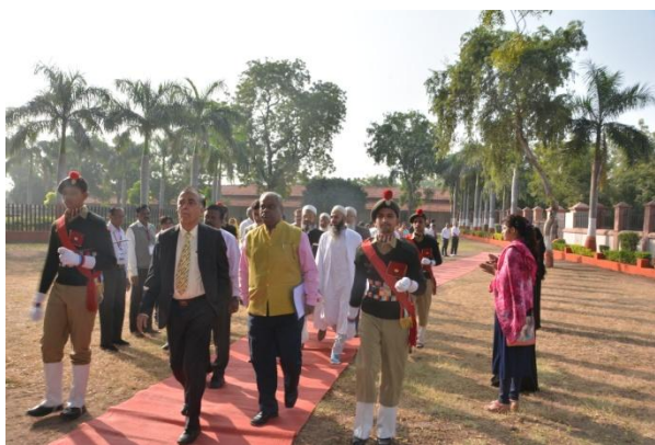
Leading PTM to the Office