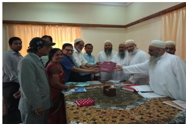
Management & staff representatives sharing the joy of accreditation

Received NAAC Certificate From Bangalore