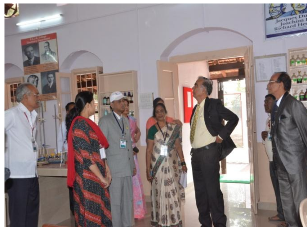
Visit to Chemistry department