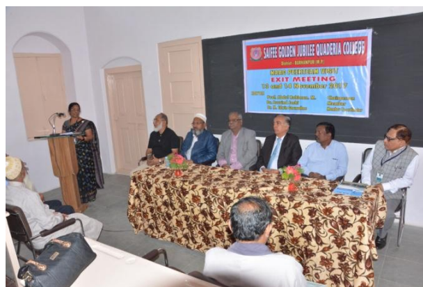
Vote of thanks