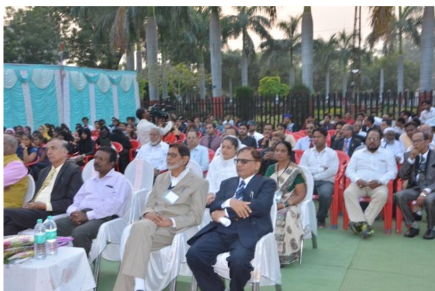
Audience at cultural programme