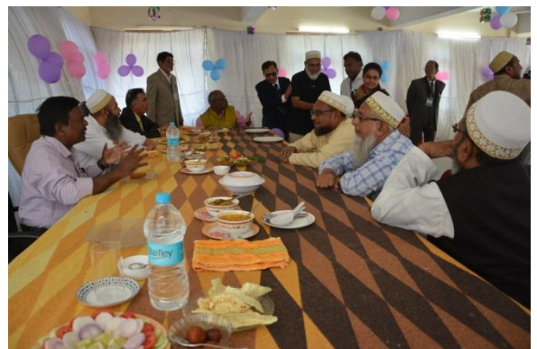
PTM, lunch with management & staff