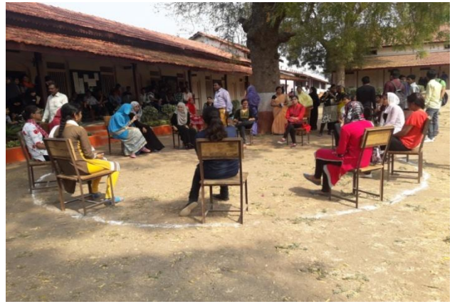
Girls' musical chair race