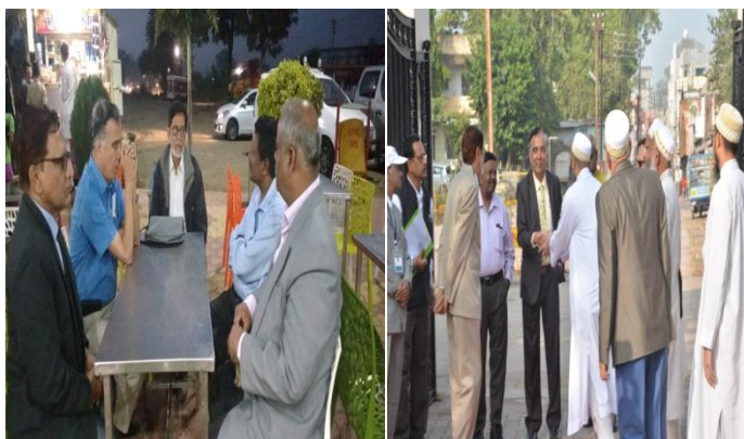
Welcome NAAC Team by Management