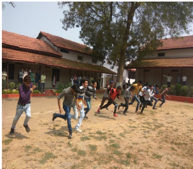
100 mtr. boys' race