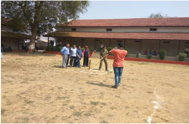
Goodwill cricket match opening