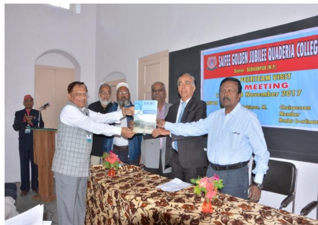
PTM handing over report to the principal