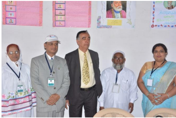
Chairman in Arts department