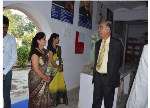
Microbiology department visit