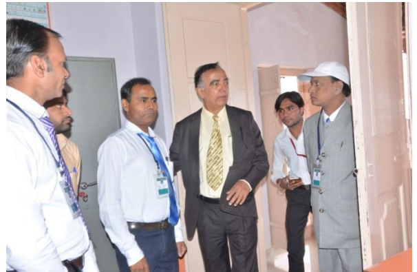
Chairman in Computer department