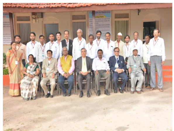
PTM with Non-Teaching staff