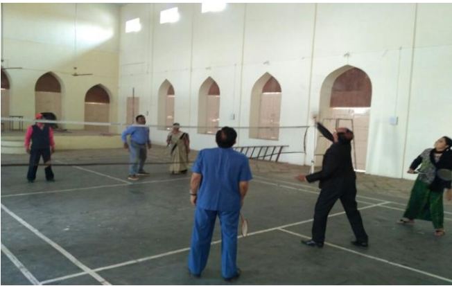
Badminton match competition opening by staff