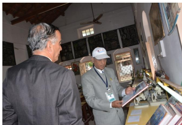
Chairman in Botany department